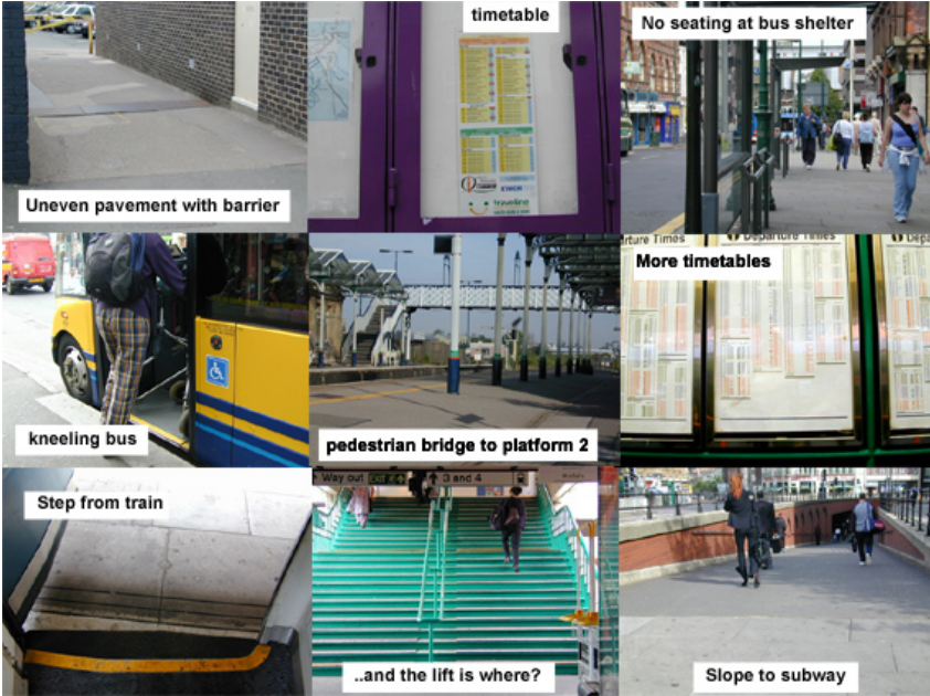
Figure 5. Potential barriers faced during a typical journey.

As part of the AUNT-SUE consortium two test-bed sites have been identified: in the London Borough of Camden and in the County of Hertfordshire, both of which have council representatives on the project. As part of our whole journey approach we will use the test-beds to identify a number of relevant journeys from which we can collect data. The journeys will be based on observation and real world experience from people in the area and will include all of the accessible design elements that the individuals will have to deal with on those journeys. In particular we will identify the potential barriers faced by the people who make these journeys. These barriers may take many forms and are likely to include a range of: kerbs, pavements, slopes, steps, street furniture, cash dispensers, ticketing machines, lifts and escalators, toilets, transport types, and so on. Clearly, many of these potential barriers may be interacted with in the course of making a typical journey and if any one prevents the user from achieving a relatively small part of the overall task it may well prevent the journey from being possible.