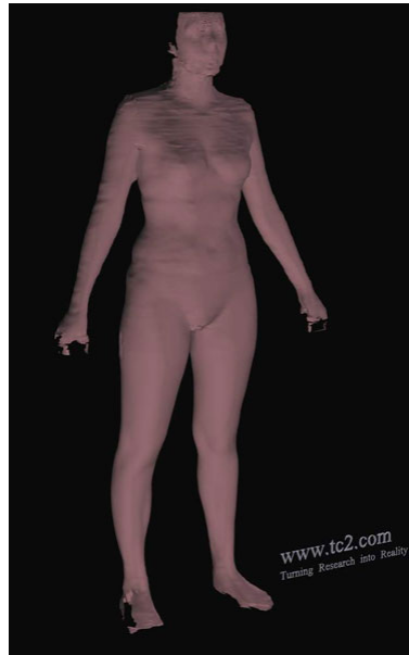
Figure 4. An example body scan from the [TC] 2 scanner.

and also provides a computer representation of the subject's body form which could be used for human modelling purposes in the future.