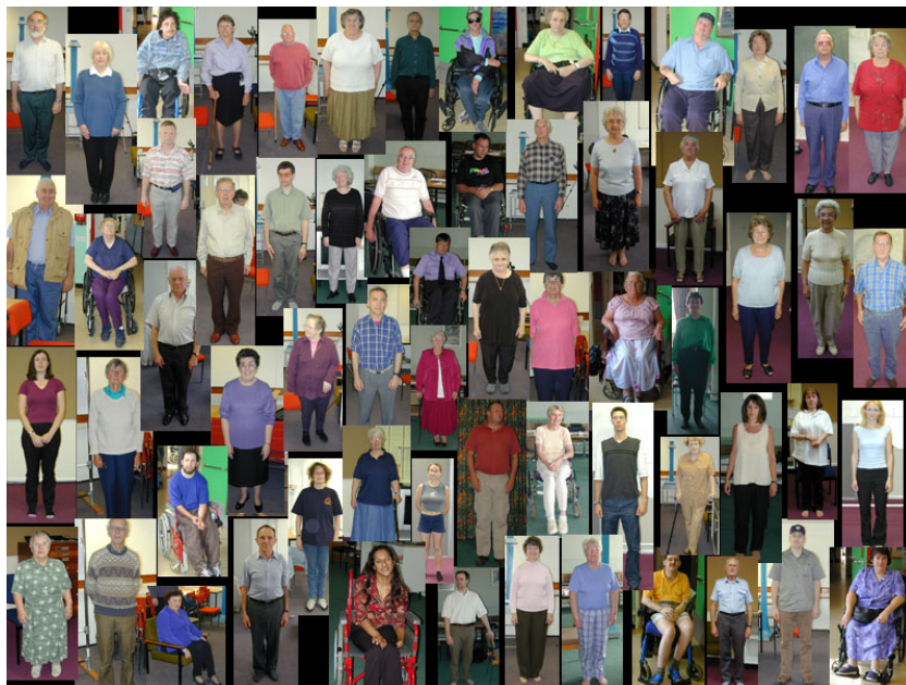
Figure 1. The HADRIAN database contains information on a broad range of individuals.

In response to these concerns HADRIAN consists of two main elements. The first is a database consisting of physical and behavioural data on 100 individuals covering a broad range of ages and abilities. The sample is deliberately skewed towards the older and disabled population to offset the relatively well understood younger / able bodied population. Data are available on anthropometry, joint constraints, background information and also notes on any disabilities and problems experienced with activities of daily living (Gyi et al, 2004). A key feature of the database is how the data are presented. The database is effectively a catalogue of individuals, allowing the user to browse through the people in the database. This approach fosters empathy between the designer and the people who they are designing for, and attempts to minimise the dehumanizing effect of the virtual environment in which the design is being created. It also moves away from decisions to deliberately design out a proportion of the population based purely on the numbers.