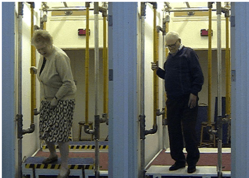
Figure 3. Images taken from video of subjects using the ingress/egress rig.

Significant amounts of additional data are being collected as part of the AUNT-SUE study. This includes features such as ingress and egress capability and behaviour from a range of public transport types. An adjustable experimental rig was constructed that could be used to simulate entering and existing from UK rail, coach and bus vehicles with a range of step heights and handle locations. Participants were videoed traversing the rig at a range of step heights that represented what they were comfortable attempting.