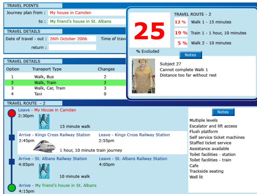
Figure 6. Journey planner interface highlighting the train station element of Travel option 2. Notes indicate possible issues with this element. Interface also shows 25% of the database's 100 individuals being excluded from this journey.

This part of the HADRIAN system will be available as a journey planner. Journey planners already exist (Transport Direct, 2007) and much of this common interface functionality will be adopted. A starting point and destination will be entered, dates and times of travel accounted for and the system will provide a number of options for completing the journey. What is novel about the HADRIAN approach is how the user can assess the individual journey options and the elements of each journey option. A particular journey can be examined and details about each component of that journey can be interrogated. A user can see that a short walk actually includes a number of steps, or a steep slope, that there are benches to sit on along the route of the walk, and that the route is often crowded at the specified time of travel. All of these factors would allow an individual to make a much more accurate assessment of their ability to complete that element of the journey. As a design tool, the journey planner will allow a designer to investigate typical journeys that make use of their design be it the infrastructure, a new train station, or just a ticket barrier that will be encountered along the way. HADRIAN will then assess the journey using the database of 100 individuals and record where each has difficulties and report back who would be designed out.