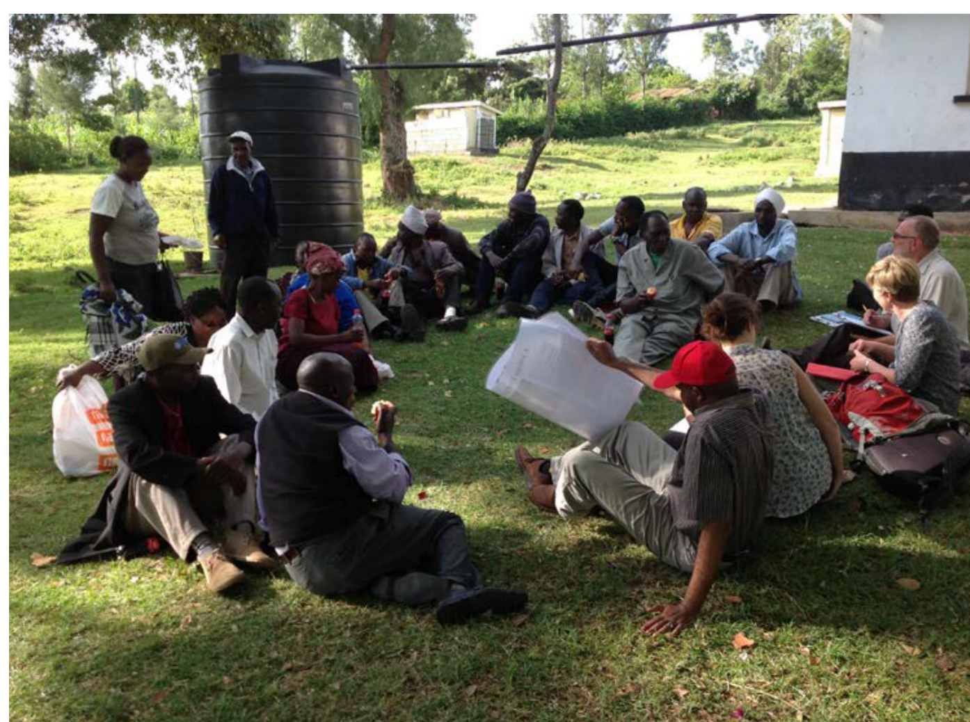
Figure 3. Consulting the Village Energy Committee - Echareria, Mbaruk