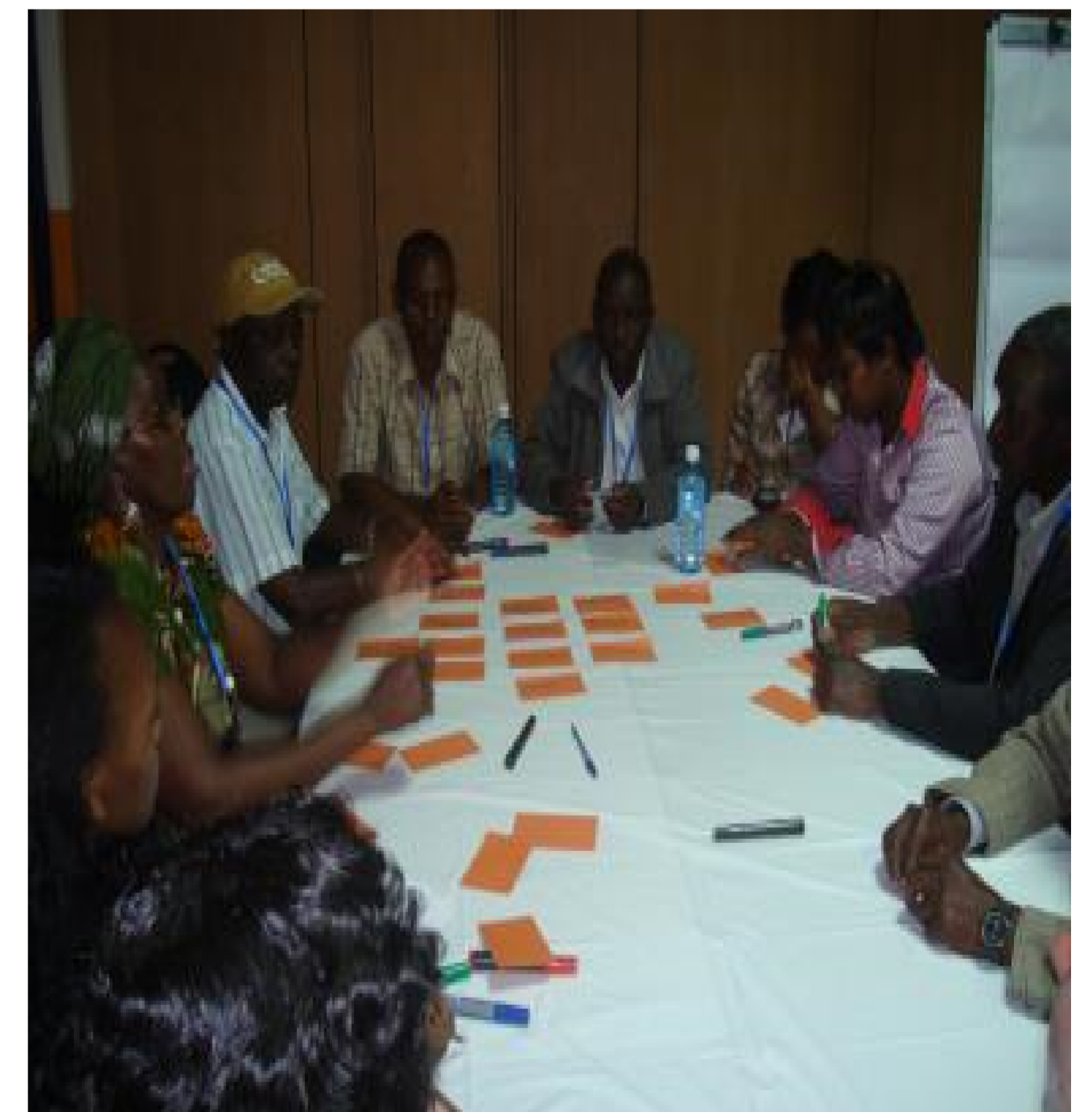
Figure 2. READ Decentralization workshop in Nakuru, Kenya