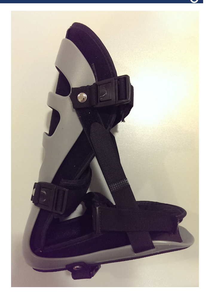
Figure 1 Tension night splint device.

Patients completed a structured questionnaire about their symptoms before treatment commenced and at each the 6 week and 3-month follow-up visits. These outcome measures include questions about pain, as well as a range of validated PROMs which include questionnaires about local function (FFI-r and MOXFQ, in addition to measures of global function (EQ-5D-5L). Questionnaires are also used to examine the impact of symptoms of other areas of functioning including measures of anxiety and depression symptoms (HADS) and sleep quality (PSQI). In addition, questionnaires are used to quantify levels of physical activity. These include the short-form (7-day recall) version of the International