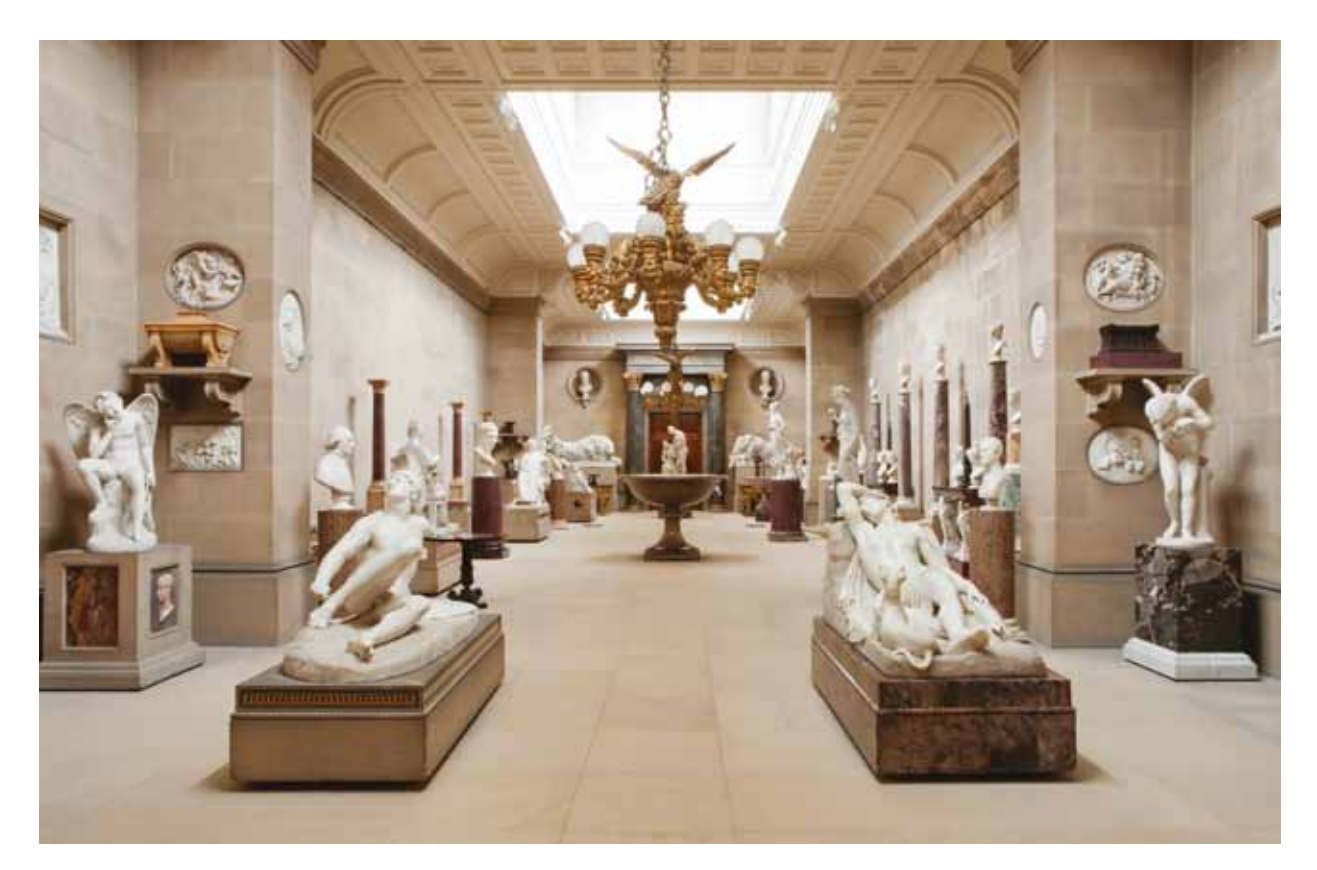
Fig.8.1. Chatsworth Sculpture Gallery (looking north).