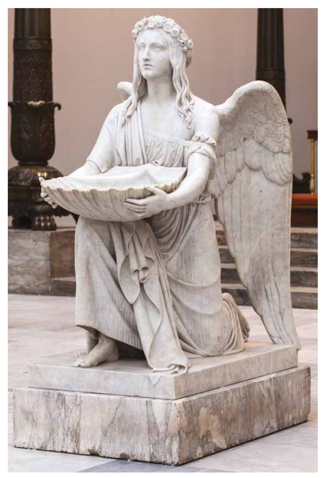
Fig. 8.6a. Bertel Thorvaldsen, Baptismal angel, 1839. Marble (Church of Our Lady, Copenhagen)