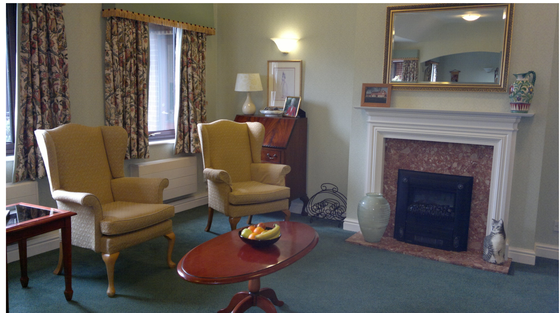
Figure 2: Lounge area of a dementia care home. In line with current dementia design recommendations, it has a non-institutional appearance and is "homelike".