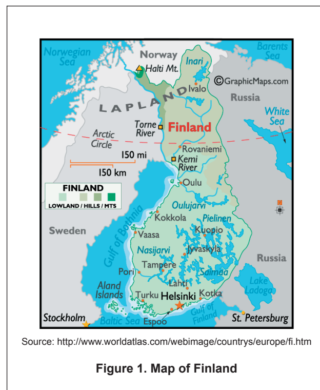
Figure 1. Map of Finland

338,145 km 2 , out of which about 10 percent (32,000 km 2 ) is water, 69 percent forest and 8 percent cultivated land. The population of Finland was 5,255,580 at the end of 2005, and the population density was thus 16 persons/km 2 . Of the population, 65 percent live in towns or urban areas and 35 percent in rural areas. About 1 million people live in the Helsinki Metropolitan area.