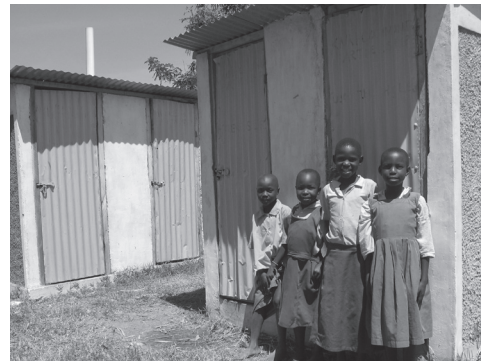
Photograph 3. Separate toilet facilities for boys and girls help to address important gender issues relating to privacy and safety, Siaya District, Western Kenya