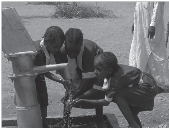
Photograph 1. Hand pump borehole at Central primary school, Shiroro, Niger State

Source: Data from SUBEB of Katsina, Niger and Sokoto.