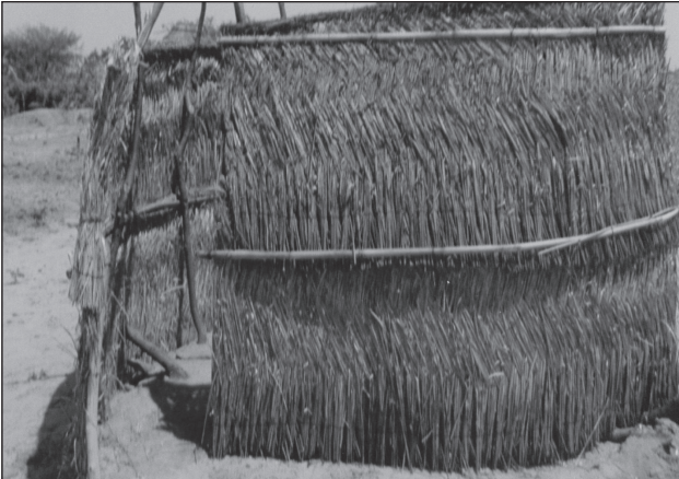
Photograph 4. Superstructure made of grass mats