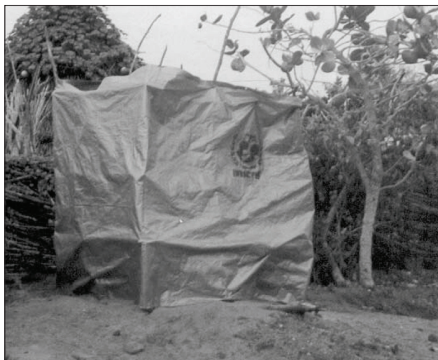
Photograph 3. Superstructure covered with a plastic sheet