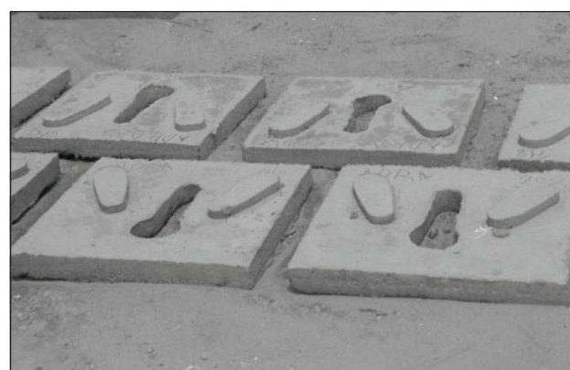
Photograph 2. San plat slabs