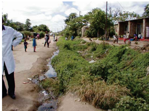
Photograph 1. Before drainage constructed

The solution for improved sanitary disposal of faecal matter was to construct VIPs for the purpose of demonstration. The following steps were adopted: