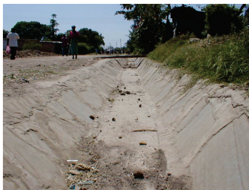
Photograph 2. Completed construction of drainage system