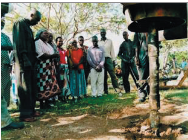
Photograph 1. Prayers before drilling commences