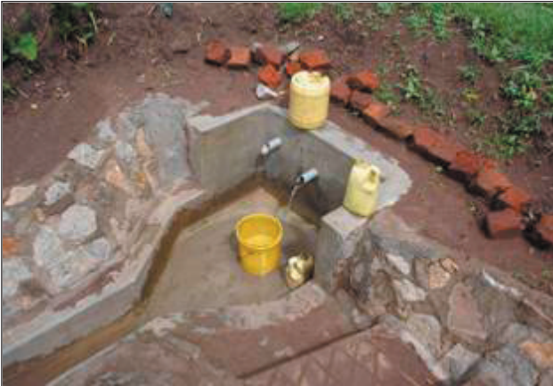
Photograph 4. Spring after protection