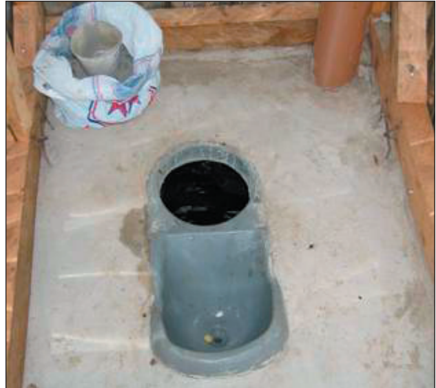
Photograph 5. Ecosan toilet

On-site disposal systems are promoted in the area due to lack of infrastructure to facilitate for off site disposal. The Ventilated Improve Pit (VIP) Latrine has been the most promoted in the region. Recently though, the concept of the Ecosan toilet was introduced and is receiving good response from the community. Ever since its introduction in 2003, there have been 43 units of Ecosan toilets which have been constructed in homesteads. The Ecosan toilet uses the concept that faeces and urine are not mixed and human waste matter