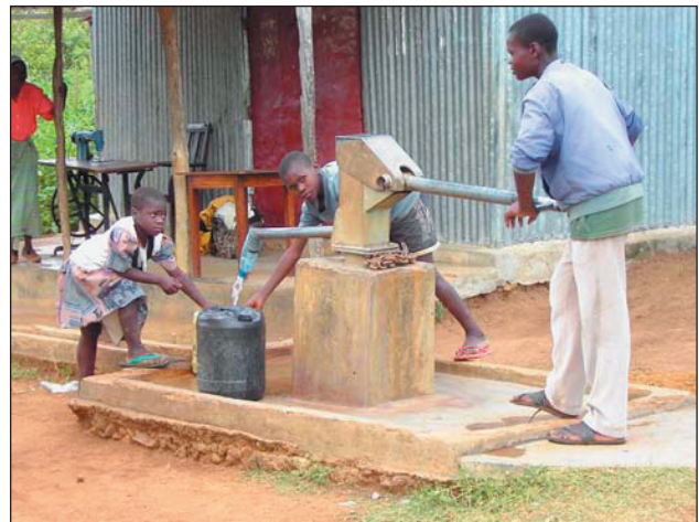
Photograph 2. Spout fitted with plastic bottle