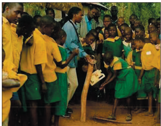
Photograph 6. Taking turns to use the tippy tap at school

This is a concept which was introduced to the region when two of the project staff came to Uganda to attend a WaterCan workshop and were able to see it being implemented. The initiative has gained popularity in the region with people putting it up in their homesteads and in institutions. The