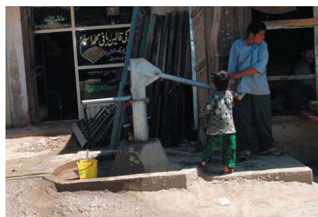
Photograph 1. Handpump installed by ACF in Dashti-Barchi area

Before war reached Kabul, most of the public wells were hand-dug and usually unprotected. From 1994, given the almost complete interruption of piped-water supply, several organisations started drilling boreholes in public places throughout the city and equipping them with hand-pumps (see photograph 1). From 1994, the main organisations involved were the French NGO 'Solidarités' and UNCHS-Habitat. They were followed by the International Committee of the Red Cross (ICRC) and by the other French NGO 'Action contre la Faim' (ACF). In 2002, the number of hand-pumps was estimated at more than 2,600 (Nembrini et al, 2002). People usually trust water from hand-pumps for drinking and cooking.