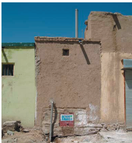
Photograph 2. Improved latrine built by ACF in Aqa Ali Shams area

reconstructed (Jansen et al, 2000). ACF initiated its water and sanitation project in 2001. It targeted areas with high prevalence of malnutrition identified through ACF network of Supplementary Feeding Centres and Mother and Child Clinics. The rationale behind this strategy was that diarrhoea is one of the main cause of malnutrition during the summer months. ACF built almost 3000 latrines between 2001 and 2005 (Pinera, 2005) and remain the only organisation currently considering this type of activity as the ICRC gave up sanitation work in 2003 (see photograph 2).