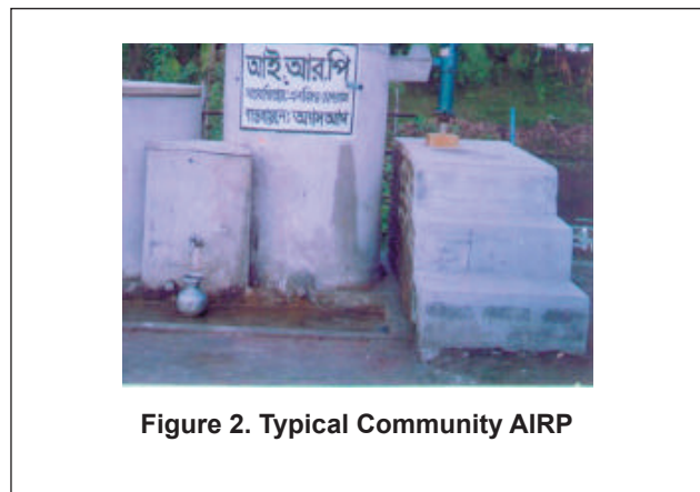
Figure 2. Typical Community AIRP