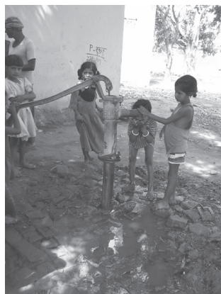
Photograph 1. Shallow hand pump: unsafe for drinking

root level in sustainable manner. If community realizes the root cause of water borne diseases they can take responsibility to protect their water sources. Three -D mapping in community is very effective (defecation habits/drinking water sources condition/diseases expenditure) and it also enhance the capacity of natural leaders/community to take their own decision to protect their drinking water sources. This can be replicable in any village for any drinking water source. This process will also provide insight for implementation of National Rural Drinking Water Quality Monitoring & Surveillance Programme initiated by Government of India.