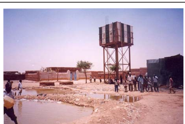
Figure 1. Surroundings of KSWC water station