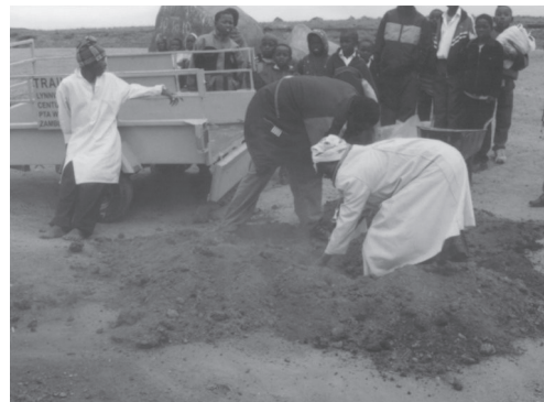
Photograph 2. Human excreta being mixed with ash and soil in Mthatha (EC)