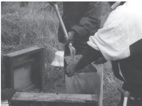
Photograph 1. Human excreta being removed from vault in Mthatha (EC)

None of the other households interviewed in the provinces, apart from NC and EC, used human excreta as fertiliser or to make compost for their gardens.