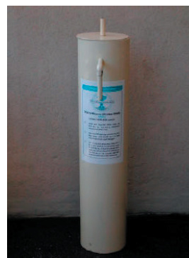
Photograph 1. Low cost defluoridator