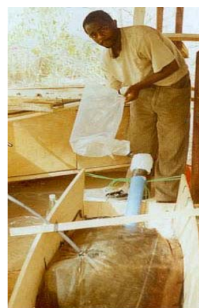
Figure 2. Collected gas being shown in a plastic bag after four weeks of digestion