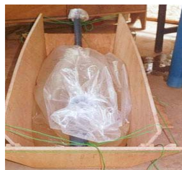
Figure 1. Overview of the digester being checked for leakages with water

A 1 m wide and 2.34 m long polyethylene sheet, with open ends, was laid as bedding on the floor of the trough. The polyethylene sheet was folded at both ends longitudinally and pushed gently through PVC pipes (0.65 m long inlet pipe of 0.11 m diameter; and 0.54 m long outlet pipe of 0.09 m diameter). The edges of the polyethylene were wrapped round the file-smoothed mouth of the pipes and fastened in position with rubber bands. At every stage, care was taken to avoid having a hole in the polyethylene sheet.