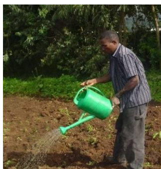
Photograph 3. Application of urine as fertiliser

In Sodo, three farmers fertilised 100 m 2 of their wheat fields with urine at an application rate of about 50 kg N/ha and applied mineral fertiliser as usual on the remaining of their fields (100 kg DAP/ha). Even though the DAP-fertilised fields were supplied with nitrogen and phosphorus, the urine-fertilised plots had yields that were 1.4 times higher than the DAP-fertilised plots. Due to these convincing results the farmers, who have also used sludge from septic tanks on their fields in the past, expressed a demand for urine for the fertilisation of their fields and suggested the construction of more urine separating toilets. All in all, farmers as well as consumers have not raised any objections, but appreciated the value of the fertiliser in the form of urine and composted excreta.