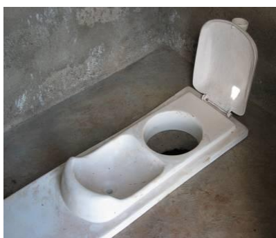
Photograph 1. Squatting type toilet made of fibre glass

To facilitate the introduction of urine separating toilets in Ethiopia and to create value within the country the production of urine separating toilets has been initiated and realised with local companies. Currently, a squatting type as well as a sitting type out of fibre-glass reinforced plastic is available. Fibre glass plastic has the advantage of being easily adjustable if the need for alterations is arising. In addition, the products can be fabricated on request and in a small number. However, since the costs for this type of production are relatively expensive when it comes to mass production, the cooperation with an Ethiopian ceramics factory brought forth the production of a squatting type of toilet out of ceramics.