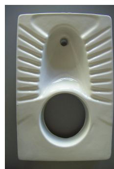
Photograph 2. Squatting type toilet made of ceramics