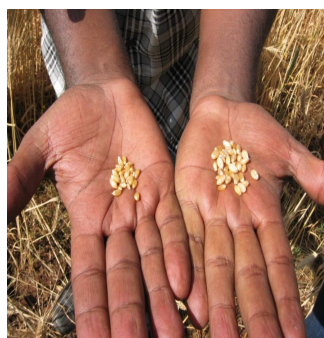
Photograph 4. Comparison of yields (left hand: conventional fertiliser, right hand: urine fertilising)