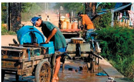
Photograph 1. Water sellers in Ha Tien can charge up to VND 50,000/m 3 (US$3.20/m 3 )

Community organizations like the Town Women's Unions had very limited institutional capacity, no computer skills or equipment, and were not confident to accept new approaches. Community leaders lacked basic health and sanitation education or knowledge of infrastructure, lacked communication skills such as facilitating group meetings and organizing training, and had little exposure to outside ideas. Their capacity in planning and management was weak and there was little belief in community participation.