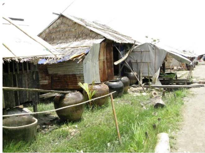
Photograph 2. Rainwater Collection in Earthen Jars