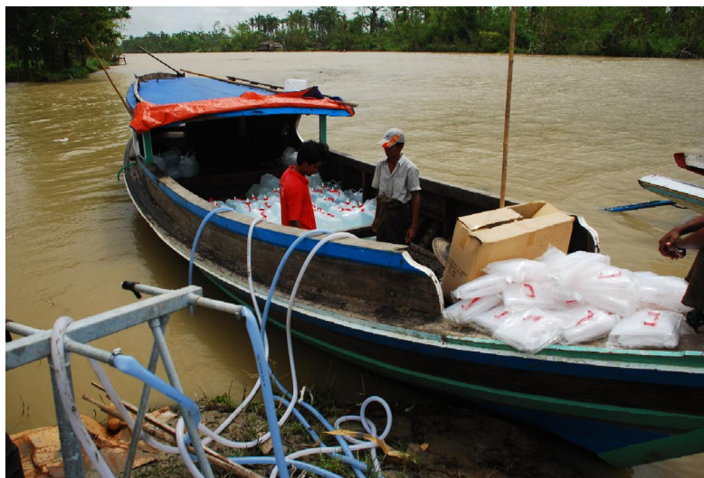
Photograph 1. Chlorinated water distribution by boat

Prior to the cyclone, it was generally believed that while Ayeyarwady Delta residents had a high degree of awareness of the need to treat water before consumption, the knowledge of how to most effectively treat water varied among households. The ACF report of February 2008 found that while many households (77%) routinely filtered the water to remove debris, sand and other particles, only 23% of households used boiling or chemical disinfectants to kill bacteria and/or viruses. The most common water treatment practices in the Delta are filtering sediments and debris through cloth, or allowing water to settle overnight before consuming 5 .