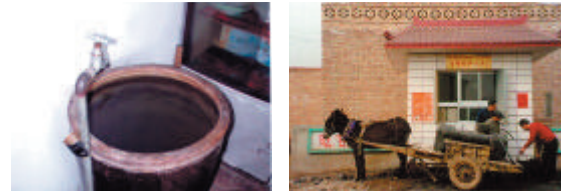
Photo 5. Arsenic safe piped water supply to village home