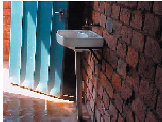
Photograph 1. Handwash facilities inside an ablution block

For a number 1, it is also more important for a woman to wipe herself afterwards, which then requires the disposal of whatever is used for wiping. A man however can shake off any residual urine.