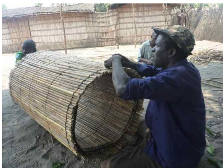
Photograph 2: Wooden frame (nkhokwe) is constructed using local reeds woven with rubber threads taken from tyres

In Salima, the design session was conducted in a lakeshore village with sandy soil. A CLTS triggering event had occurred two years earlier. Due to the momentum developed during the CLTS program, Government staff were able to identify ‘lead-users’ to participate in the design sessions. ‘Lead-users experience a problem or a need that they cannot fulfil with a current product or service and develop modifications or novel applications’ (Steen 2011). The lead users identified the challenges of existing sanitation designs and offered immediate solutions. The solution combined the existing wooden frame (nkhokwe), wrapped with plastic and reinforce with sandbags (Photograph 2 & 3). The sand-bags were constructed by cutting and re-sewing local maize bags.