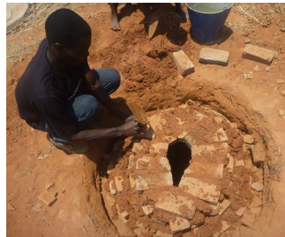
Photograph 1: Top view of prototype of corbelled design