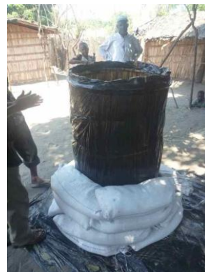
Photograph 3: Wooden frame (nkhokwe) is wrapped in plastic and reinforced with sand-bags