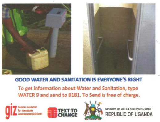
Photograph 1. The sticker/flyer use for sms showing toilet and prepaid meter