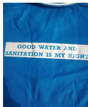
Photograph 2. The shirt to be given to lucky winners