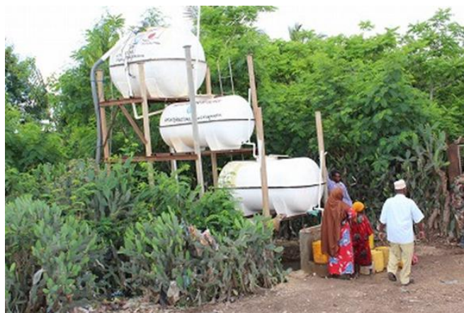
Picture 1. Three tank water treatment sstem in Afgoye, Somalia

water from these rivers is very poor due to high turbidity of more than <200 NTU, and dumping of waste material.