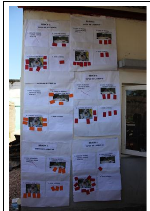
Figure 3. Results of participatory exercise to identify the proportion of toilet types

The whole bairro is divided into smaller areas (6 for Maxaquene A and 4 for Chamanculo C) and each of these areas is assessed separately. In the second part of the workshop, participants are asked to indicate which types of toilet are most prevalent in the different areas of the bairro . Participants are grouped into the area of the bairro in which they reside. The groups are given ten counters which they proportion to indicate which types of toilet are predominant in their area. The final part of the workshop is based on the conceptual framework for risk assessment described above which has been translated into a rapid participatory process for community engagement to score the perceived risk. Each indicator is scored based on a simple traffic light system: