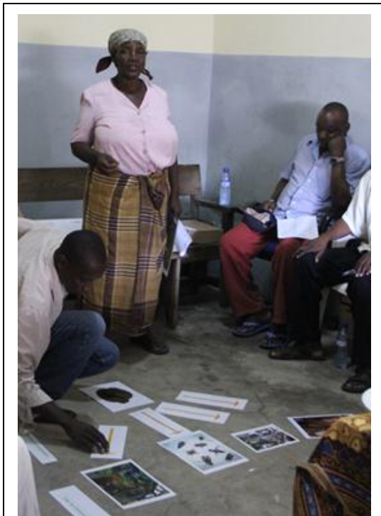
Figure 2. Participants from Maxaquene A discuss disease transmission routes

As the participants enter the workshop room they are greeted by a handshake from the facilitators who have glitter on their hands. During the workshop when people touch other parts of their body, e.g. scratching or wiping ones face, then the glitter is transferred. The glitter provides a didactic illustration (and also amusing) to highlight to participants how easy it is for pathogens to be transmitted from hand to mouth. This is followed by an interactive session in which participants explore the other primary transmission routes of excreta-related disease using cards and arrows representing different parts of the F-diagram (see Figure 2).