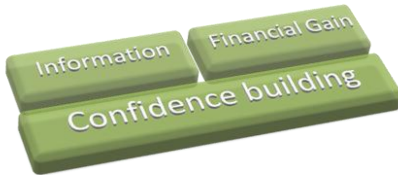
Figure 1. Three main drivers for adopting ICT innovations in the WASH sector