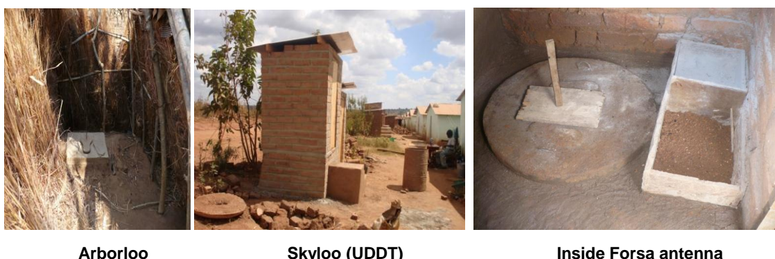
Figure 1. Types of ecosan latrines

In Malawi, three types of ecosan are available. Their shape and size are mostly determined by that of the san plat used. The types include Fossa Alterna which means alternating pits, the Skyloo which is built above the ground with double vault for collection of human excreta once decomposed within 6 to 12 months, and is also called urine diverting dry toilet (UDDT) if urine is separated from faeces and the arborloo which is a simple, composting toilet with a portable slab, pedestal and superstructure (Fig. 1). The arborloo pit is dug up to one metre in depth (Ministry of Irrigation and Water Development., 2011).