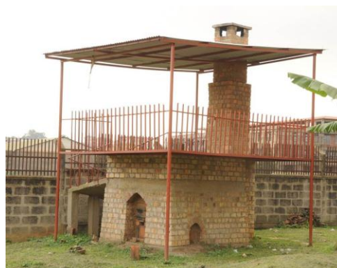
Photograph 3. Pilot kiln in Kampala, Uganda