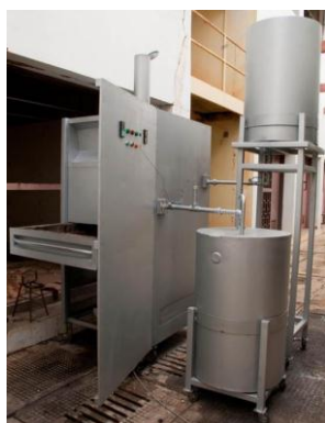
Photograph 2. Pilot kiln in Dakar, Senegal