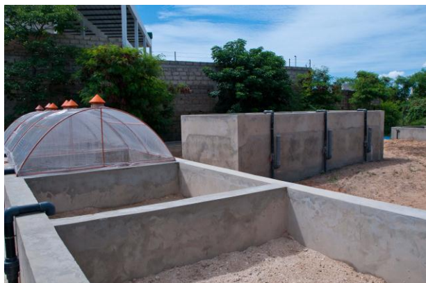
Photograph 1. Unplanted drying beds at the FaME research facility at Cambéréne Wastewater and Faecal Sludge Treatment Plant in Dakar, Senegal.

the sludge did increase the drying rate, and could result in a reduction in required land area of around 25% (Seck et al., submitted). The FaME partner Waste Enterprisers has also built a pilot-scale greenhouse in Mombasa to further experiment and optimize the operating parameters for solar drying of FS.