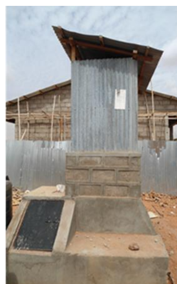
Figure 1. Schematic view of a UDDT