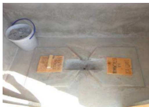
Photograph 3. Inside a UDDT with signs indicating which side is in use