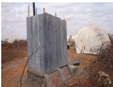
Photograph 2. UDDT Superstructure