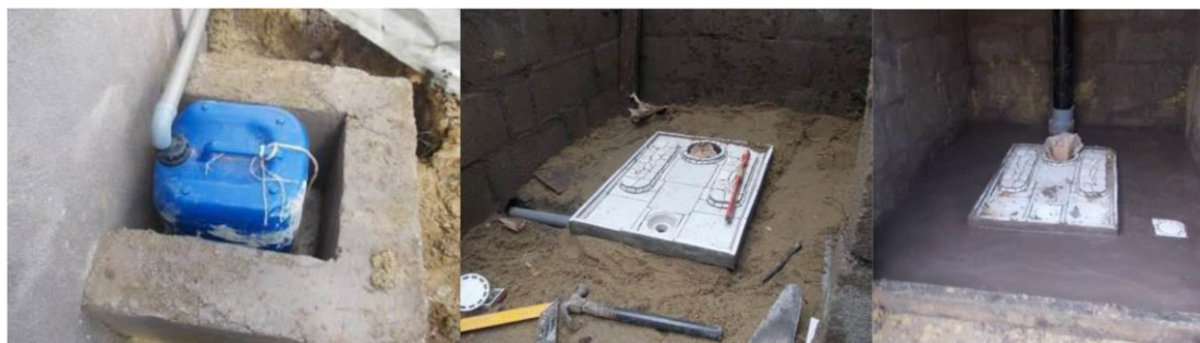
Photograph 2. Seat of the plastic drum UDDT developed in the MAFADY Project