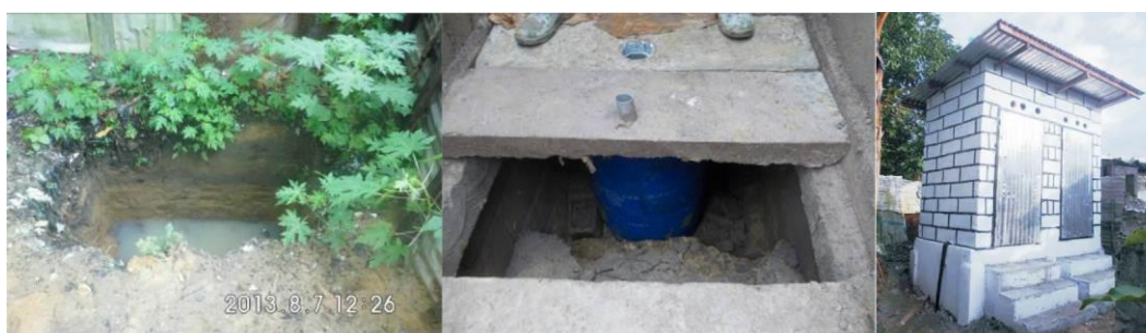
Photograph 1. MAFADY Drum Urine Diverting Dry toilet (from left to right: empty pit, drum pit 2 and the cubicles)

Based on previous experiences and given specific constraints, the Plastic Drum Urine Diverting Dry Toilet (DUDDT) was designed. It is made of twin cubicle placed on top of plastic drums who serve as pit. Walls are made of cement blocks to feat humid salty air conditions. The space required for the latrine is 6.3 m 2 (2.4 X 2.6 m) and the drum volume (250 litres), which provides one year use for each drum, considering a family of six (06) members. The pit is ventilated by one vent pipe of 100 mm for each drum. Protection walls are provided for the drums and allow a nice looking of the toilet (Photograph 1).