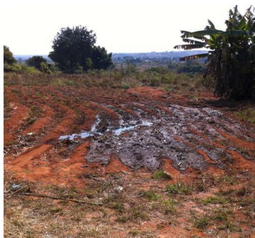
Photograph 1. Use of untreated Faecal Sludge in gardens

adenovirus, enteric adenovirus types 40 and 41, enterovirus types 68-71, hepatitis A and E, poliovirus and rotavirus. These cause enteritis, meningitis, encephalitis, paralysis, hepatitis and poliomyelitis. (iii) parasitic protozoa namely Cryptosporidium parvum , Cyclospora histolytica , Entamoeba histolytica and Giardia intestinalis which cause cryptosporidiosis, amoebiasis and giardiasis. (iv) helminths like Ascaris lumbricoides , Taenia solium/ saginata , Trichuris trichura , hookworm and Schistosoma spp. which cause enteritis, taeniasis, trichuriasis, anaemia and schistosomiasis. The effects of these ailments cant not overemphasised as some can even be fatal if left untreated.