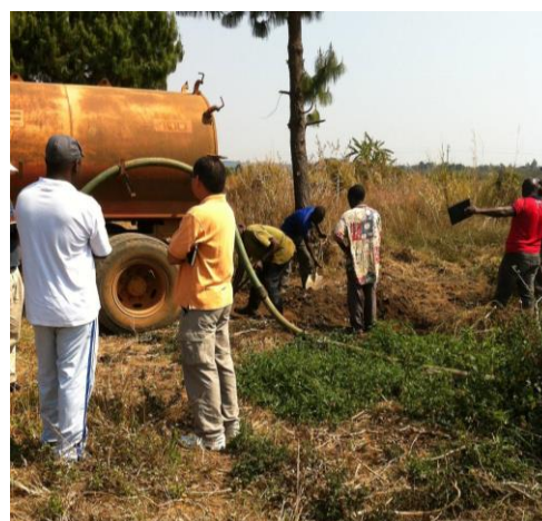
Photograph 2. A privately operated vacuum tanker collecting dry sludge they had previously damped indiscriminately