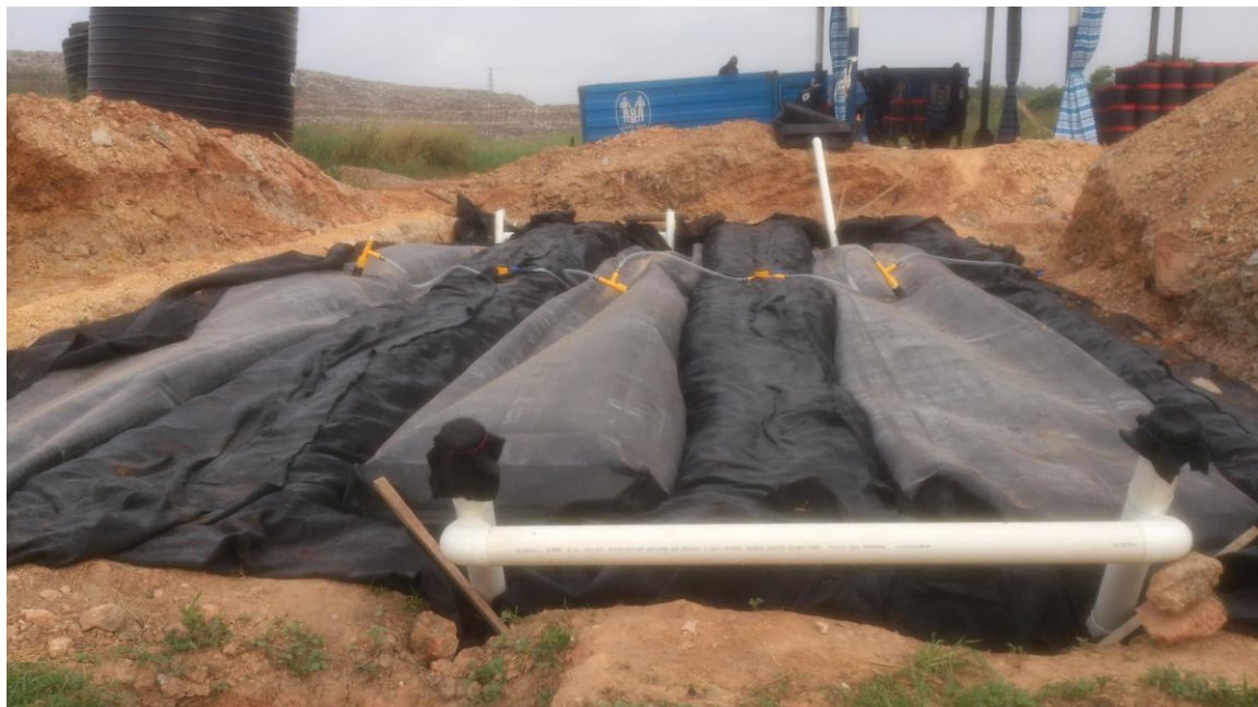
Photograph 1. The anaerobic digesters during installation