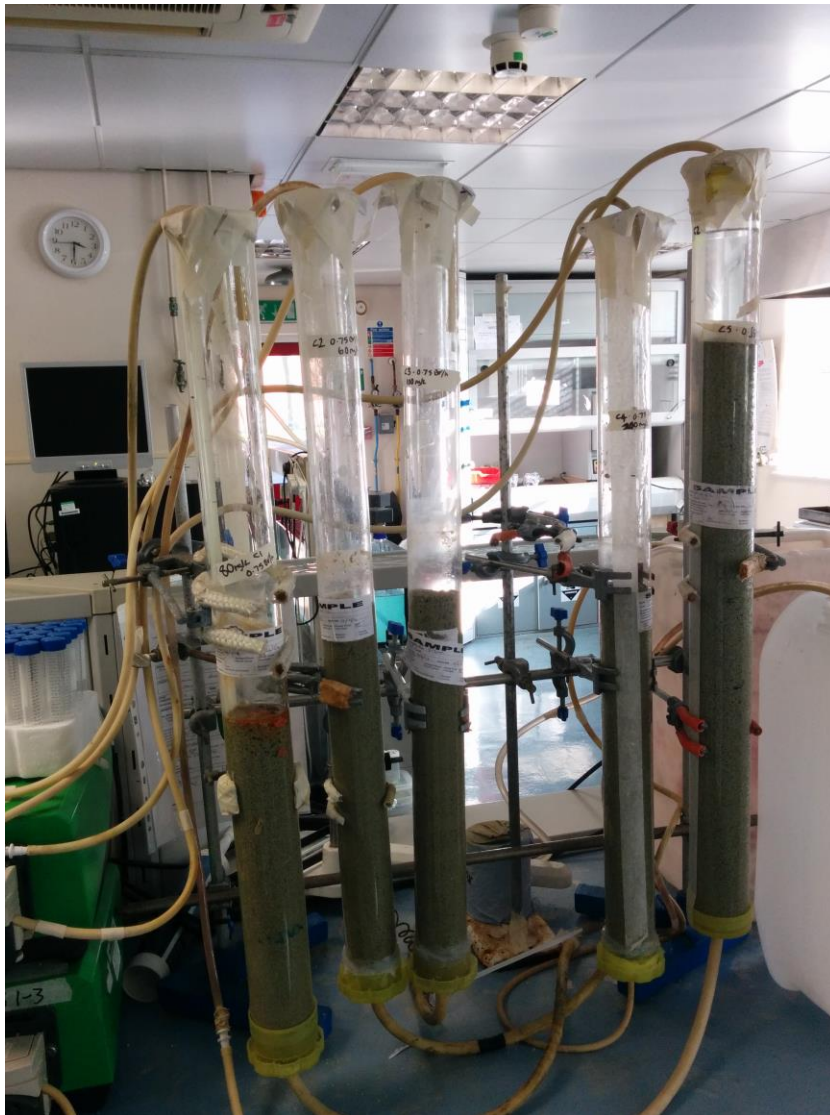
Photograph 3: Column scale experiments in the laboratory at Cranfield University to determine drying bed design parameters