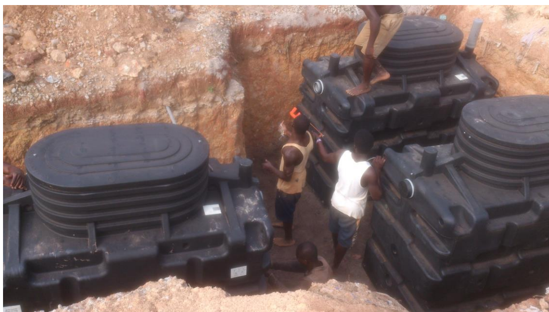
Photograph 2. The Biorock tanks during installation (anaerobic on the left, aerobic on the right)

Although the Biorock system was developed in Luxembourg for the treatment of household wastewater, it was appealing as the ventilation is executed by natural draft, so no external energy is required, and the modular combination of aerobic and anaerobic technologies will be easily replicable throughout the world. It will be the first application of this system for treatment of non-waterborne sewage. It is a modular two-stage treatment system, where raw sewage first enters a primary tank to provide pre-separation and initial breakdown of organic solids in an anaerobic environment. The liquid effluent then passes through an effluent (bristle) filter before discharging into an aerobic tank containing synthetic filtration media, pretreated with enzymes that stimulate the growth of aerobic bacteria. It has a much shorter solids retention time, and the first stage which is effectively a conventional septic tank is not designed to work with high solids waste so will require regular desludging.