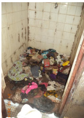
Photograph 1. Latrine in detention centre before intervention

access to safe water, good hygiene and adequate sanitation in all prisons of the country. A health committee was created by the Bolle Detention Centre, a budget was provided by the centre for maintenance of the latrines constructed and to maintain hygienic conditions throughout the centre.