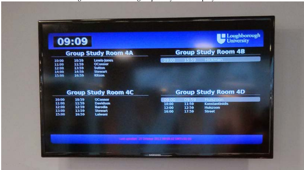
Figure 2 : 'Branded' group study room display screen