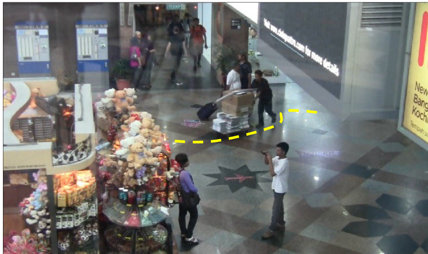
Figure 3: Personal space and avoidance angle

Personal space refers to the invisible surrounding/territory or spaces around human beings. Personal space is considered as a social condition that affects communication or contact between humans. In general, older and disabled people have a larger personal space compared to the young and able-bodied. Figure 3 shows an example of a worker moving with a trolley. The worker performed avoiding action (refer section 3.6) to maintain the personal space and avoid collision with two other people that have stopped in front of the movement path. The new movement path is shown as a yellow dashed line.