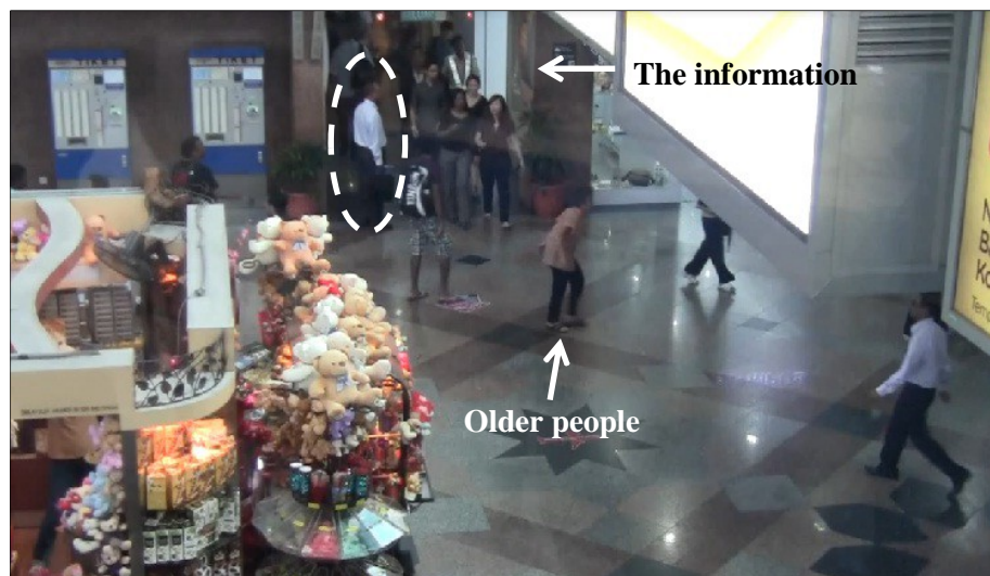
Figure 2: Example of the field of view affect

Field of view (FOV) refers to the extent of the observable range seen by a human at any given moment, and this is typically 120 to 180 degrees. FOV is important since humans develop their perception of the environment during the movement primarily from visual data (Sukhatme, 2011). Figure 2 shows an example where an individual human has stopped in the middle of walking path and is looking around. There are moments when the individual is looking at the information at the distant end of the observed area, and this is considered to be the Move-Stop-Move Behaviour. The behaviour leads the man to slow his movement or to stop for several seconds. In general, older people have a lower FOV compared to the young and able-bodied due to reduced physical abilities.