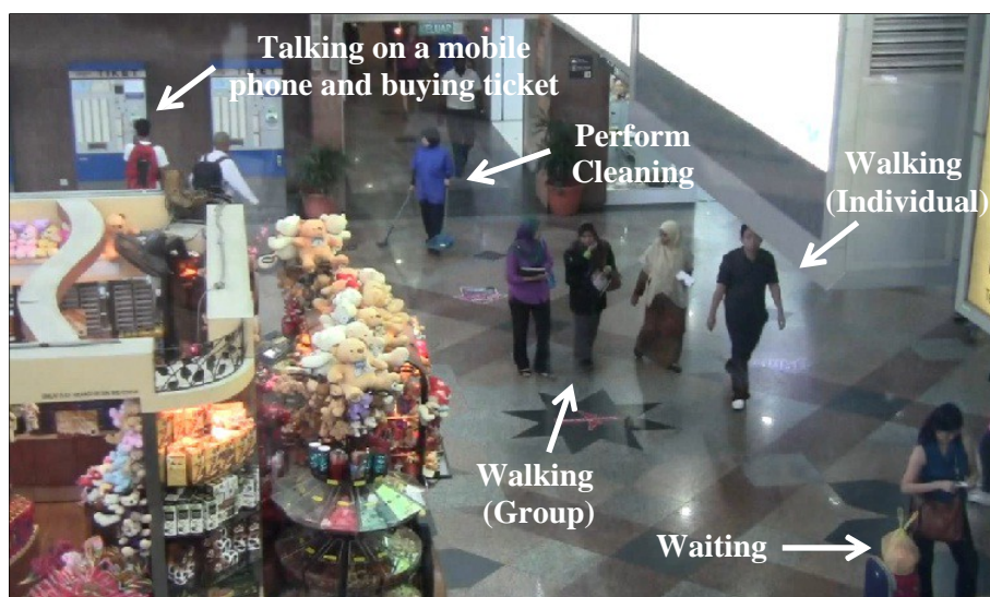
Figure 1: Example of personal objective