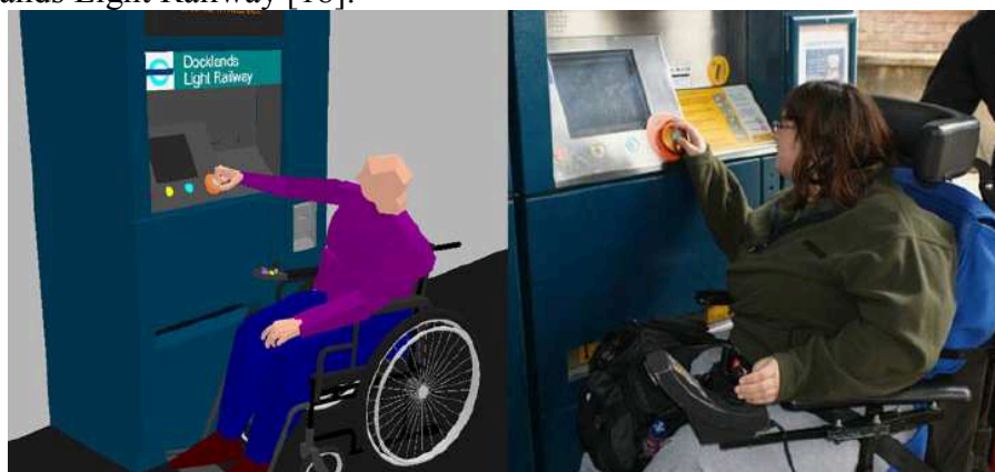
Figure 3. HADRIAN and real subject using Docklands Light Railway ticket machine [18]

It is our view that Digital Human Modelling systems are extremely relevant in the context of inclusive design but are not ideally suited to the task. HADRIAN [11] is a DHM tool that has been built on SAMMIE and includes a database of 102 manikins based on real people, many of whom are older or have disabilities. Here there is a more direct and meaningful relationship between the DHM model and the real person when compared with the statistical aggregations found in conventional DHM system. Fig. 3 illustrates the approach in evaluating ticket machines for the London Docklands Light Railway [18].