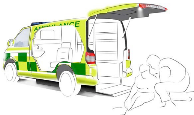
Figure 2. Concept B: Versatile RRV with rear access

This concept offered support for the future integrated service provision with a smaller vehicle than the DCA to replace current RRVs and support more options for treatment at scene. The design included the visibility of a DCA but with car-like driving characteristics. If the vehicle was dual staffed it could also be fitted for patient transport which might be particularly suitable for more mobile patients and those not requiring ED transportation. A key feature of the rear access vehicle (Figure 2) was the lowering floor to give easy level access and clearance to work whilst standing when the vehicle is stationary.