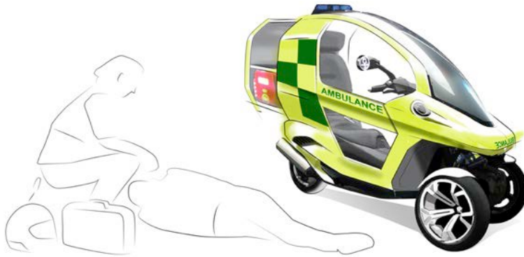
Figure 1: Agile FRV Concept

aimed to address duplication of resources where both an RRV and DCA were dispatched (with one being stood down during the response). For the future integrated care model with more patients treated at scene (home) the Agile FRV could provide a resource efficient method to reach patients. The vehicle would be single occupancy, fully enclosed, crash worthy and with good load carrying capacity whilst retaining the agility of a motorcycle.