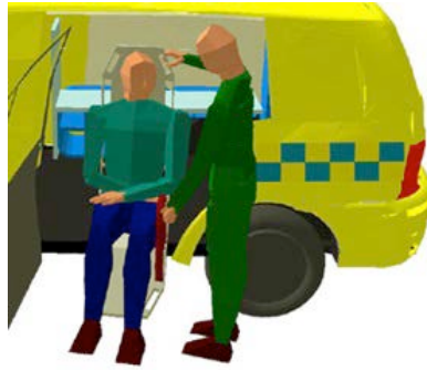
Figure 3: Concept B – Versatile RRV with side access, developed in SAMMIE CAD to investigate ergonomic requirements.