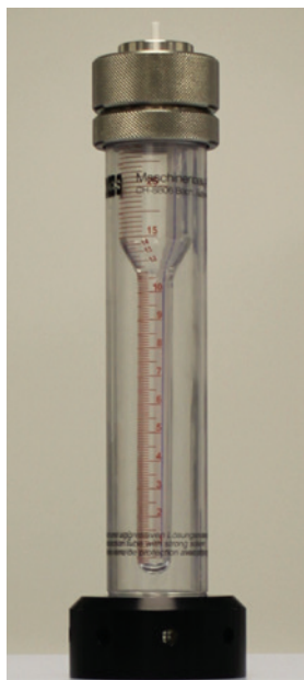
Figure 1. Comes DM density measuring device with Pyrex graduated 46.3 mL inner tube.

Laboratory Plant (DH Industries Limited, Laindon, UK). A predetermined volume of ethanol was dispensed directly into the inner tube and the mass ( \pm 0.1 g), m_e , recorded by weight difference using a XP6002SDR top pan balance (Mettler Toledo Leicester, UK). Similarly, a pre-determined volume of HFA 134a was filled through the valve and mass, m , quantified by weigh difference ( \pm 0.1 g). All formulations evaluated were mixed by inversion and left to equilibrate for five minutes prior to the determination of the liquid volume, v , using the inner tube graduation marks ( \pm 0.01 mL readability). For each measurement the head space volume, v_h , (calculated as 46.3 mL less the observed liquid volume, v ), was multiplied by the density of saturated HFA 134a vapor at 20°C, 0.0278g/mL [4] to give the mass, m_v , of the total HFA 134a vapor within the device ( 1.041 \pm 0.003 g). Air mass trapped within the tube was negligible ( <0.055 g). Thus, the mass of HFA 134a within the liquid phase, m_{134a} , was determined as m - m_v (g), giving the density of the liquid phase formulation, \rho , as: