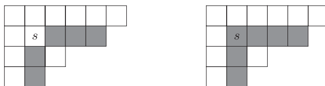
Figure 2. The shaded areas (left diagram) are the arm length a_\lambda(s) = 3 and leg length l_\lambda(s) = 2 of s for \lambda = (6, 5, 3, 2) . The shaded area in the right diagram is the hook length h_\lambda^*(s) = h_\lambda(s) = 6 for \alpha = 1 .

In this paper we will often use the multivariate generalization of the Pochhammer symbol,