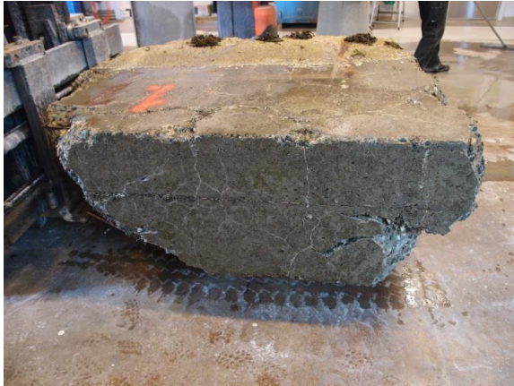
Figure 1 - Sample block, Mix 1