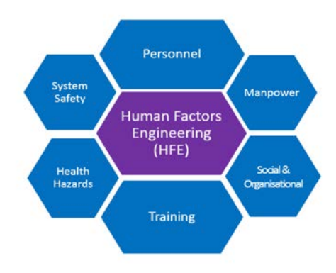
Figure 1 MOD Seven HF Domains (MOD, 2015)

The aim of this qualitative study was to explore whether this approach could translate into NHS HIT by considering the MOD seven HF domains (Figure 1) and six high level HFI process activities (Figure 2) in the context of a large acute NHS Trust electronic patient observation system.