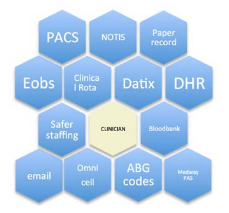
Figure 3. Clinical Electronic Systems

Ward staff, predominantly nurses and healthcare assistants, record all patient observations using individual handheld devices. The digital platform allows a range of observations to be recorded and the Trust typically records 15,000 observations per day across different many electronic platforms (Figure 3). Escalation parameters such as early warning scores (EWS) are automatically calculated and staff are prompted to escalate care to a senior clinician (nurse or doctor).