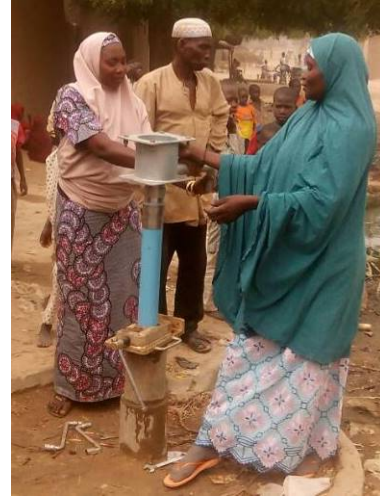
Photograph 4. Female Mechanics repairing handpumps