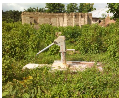
Photograph 2. Broken-down hand pump