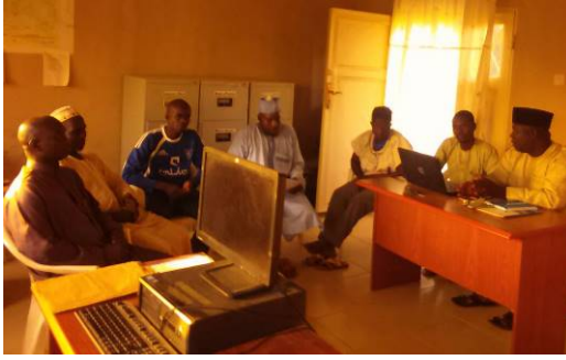
Photograph 3. Meeting of VLOM unit in Jigawa State