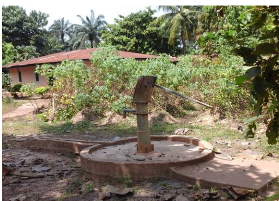
Photograph 1. Broken-down hand pump

Water sources and systems are maintained such that appropriate quantities of water are available consistently or on a regular basis. On an average, a water source functions well within the first three years, after which it starts breaking down. Most the current rural water sources in Nigeria are over 5 years old, not regularly maintained and hence at risk of regular breakdowns. Findings from the National Hand pump Functionality survey carried out by UNICEF-Tulsi Chanrai Foundation (TCF) in January 2011 indicated that only 56.22% of the hand pumps were functional at any given time. As per the survey, the most common cause of breakdown was reportedly due to poor workmanship followed by problems with poor quality of supplies and spare parts. The Federal Ministry of Water Resources, based on a survey completed in 2015, confirmed that over 58% of the completed water facilities in the country are non-functional.