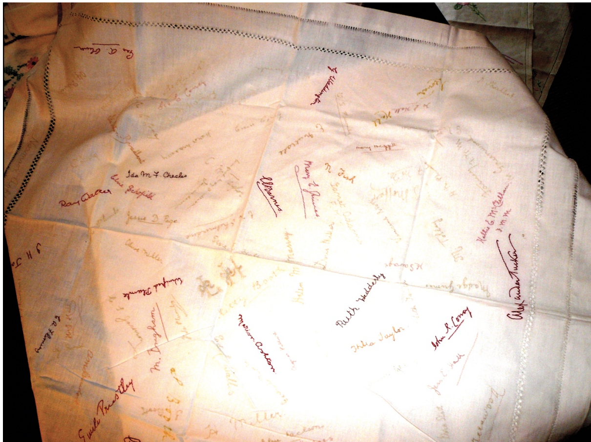
Figure 2 Subject's mother's signature tablecloth – as a prompt for an elicitation

The interview stages of the study are in the form of semi-structured interviews, using the same question set as part of the SOP. The questions (in this case) are derived from Ashworth's Fractions of the Lifeworld (2003a, 2003b), and the interviewee is asked to supply a focus for elicitation, which the questions then prompt a response about. In this case, a textile was the prompt.