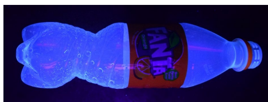
Figure 1. Side image of a drinks bottle with residual fouling under UV illumination. Note the variation in signal intensity at regions of geometric complexity.

Polymer samples (nominally 20 mm x 20 mm) were cut from a range of bottles, utilising the flattest sections available to limit the variation in signal obtained from complex geometries (see figure 1). Four different polyethylene terephthalate (PET) bottles and two different high-density polyethylene (HDPE) bottles were investigated. The samples were cleaned using detergent and their cleanliness checked using an industry standard Hygiena adenosine triphosphate (ATP) swab. The polymer samples were placed on a non-fluorescing stainless steel background.