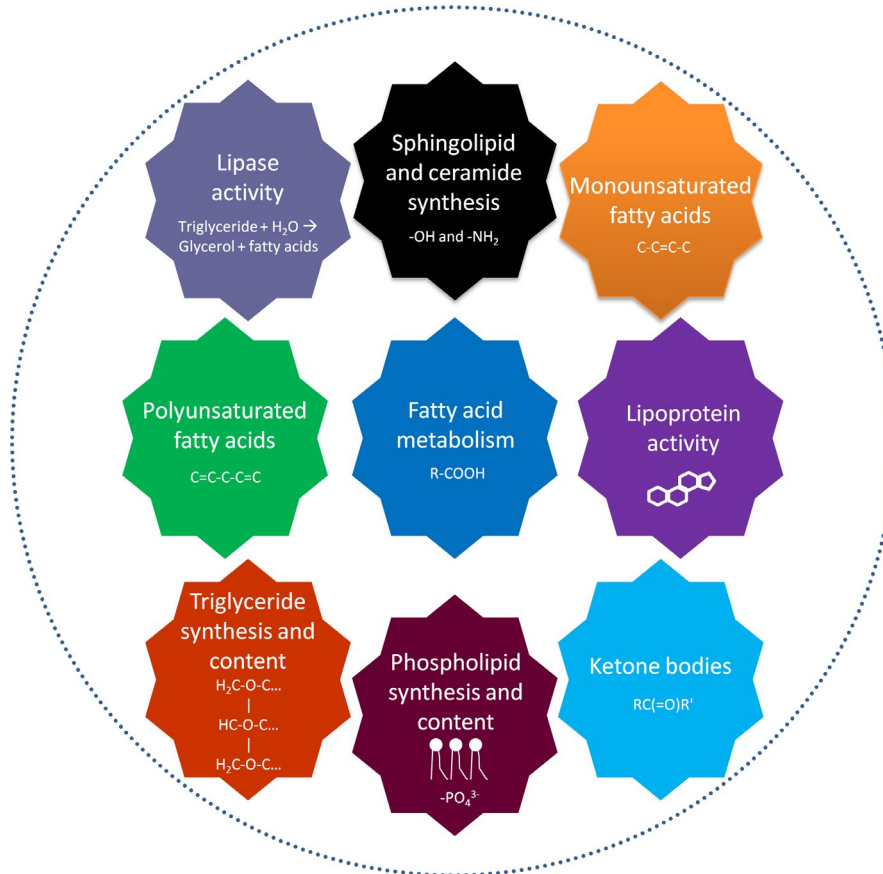
FIGURE 2 Proposed lipid-related pathways that could be targeted to extend human healthspan. The overexpression of lysosomal lipase enhances longevity in worms, while the overexpression of diacylglycerol lipase extends lifespan in both worms and flies. Gene inactivation or inhibition of genes encoding the sphingolipid-relevant sphingomyelinase-3, glucosylceramide synthase, serine palmitoyltransferase, dihydroceramide desaturase, neutral/acidic ceramidase, or ceramide synthase proteins extends life in Caenorhabditis elegans , while the inactivation of alkaline ceramidase increases lifespan in Drosophila melanogaster . Longevity can also be increased by feeding specific monounsaturated or polyunsaturated fatty acids to worms, by overexpressing fatty acid amide hydrolase in worms, or by overexpressing fatty acid-binding protein or dodecenoyl-CoA delta-isomerase in flies. The overexpression of apolipoprotein D enhances survival in flies and mice, and the overexpression of the fly homolog of this gene extends lifespan in flies. In worms, RNAi knockdown against the yolk lipoprotein VIT/vitellogenin prolongs life. Survival time can also be elongated by RNAi knockdown against low-density lipoprotein-receptor-related protein 1 and low-density lipoprotein-receptor-related protein 2 in Drosophila . Creating a deficiency in the triglyceride synthesis enzyme acyl-CoA:diacylglycerol acyltransferase 1 boosts longevity in mice and knockdown of the phospholipase A2 receptor improves healthspan parameters in a mouse model of progeria. Relevant to the latter finding, treating worms with phosphatidylcholine boosts longevity. Treating C. elegans with the ketone body \beta -hydroxybutyrate or feeding mice with a ketogenic diet additionally extends lifespan. There are likely additional lipid-related healthspan targets that remain to be elucidated

Future work should aim to better understand the mechanisms that underlie lifespan changes in response to specific lipid-related interventions in model organisms. Additional research in vertebrate models, such as African turquoise killifish, mice, rats, and Rhesus monkeys, is especially needed. Identifying unique lipid characteristics shared among animals with extreme longevity (e.g., Greenland shark, bowhead whale, giant tortoise, and ocean quahog clam) or theoretical immortality (e.g., planarian flatworms and hydra) would also help illuminate pro-longevity lipid pathways. Another approach would be to do comprehensive analyses of healthspan parameters and the incidence of age-related disease in patients being treated with lipid-relevant pharmacological interventions or patients with lipid-related genetic mutations. This would help to identify targets