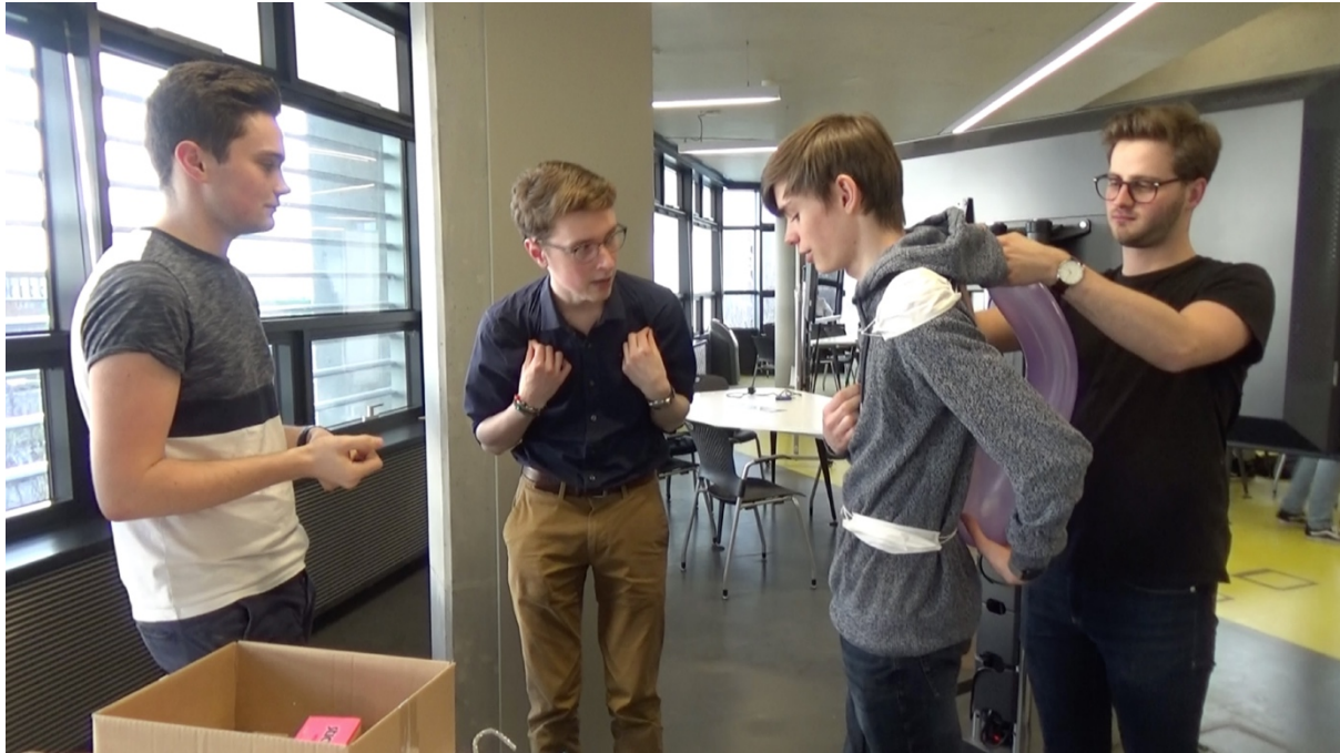
Figure 3. [AUTHOR] students experience prototyping.