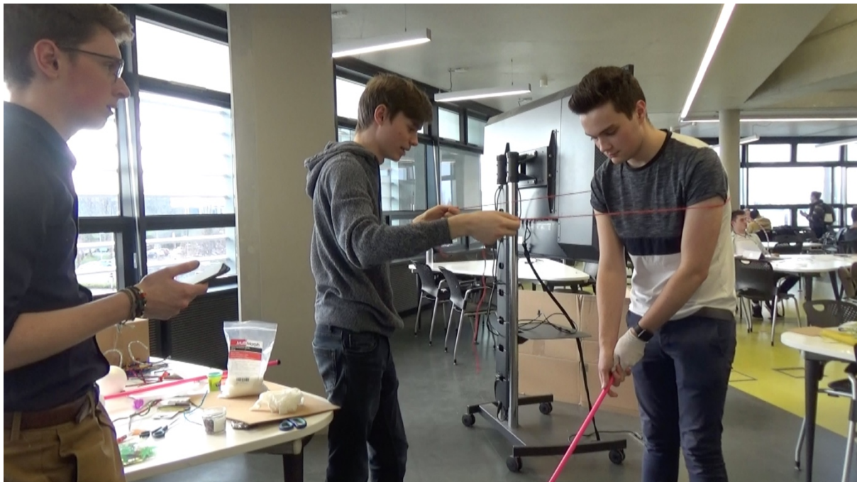
Figure 4. Exploring the role of digital touch within a golfing context.

Experiments with different forms of digital touch are apparent (a surgical glove is being used as a prop to signify a smart glove that senses the golfer's grip on the club; string and a balloon are being experimented with to explore how pressure on the back and/or shoulders could be used to direct the golfer into the correct posture as part of a shirt-based wearable). Although the nature of the sensations conveyed was discussed and negotiated amongst the student designers, this was 'broad brushed' typically at the level of 'inputs' and 'outputs' (e.g. the thumb of the glove could vibrate to alert you [the golfer] that the grip is correct and you can begin to swing). Digital touch here was mainly concerned with the translation of binary information towards a yes/no user relationship with the concept. Are my shoulders