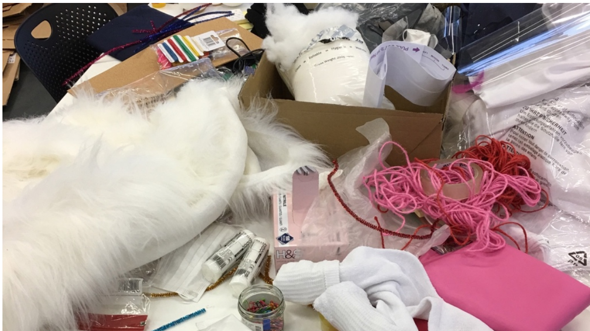
Figure 2. Sensory materials used within the workshop.

The materials were introduced to the ID students in the first of three workshops (see Fig. 2.), designed to support ideation of initial ' sketchy ' concepts, before experience prototyping one or more of these concepts using the QPTR process. The premise was that at this divergent and creative stage of the UXD process (the 'Develop' stage of the Double Diamond) exposure to a wide variety of sensory materials would provoke the students to consider a broad range of touch-mediated communication experiences.