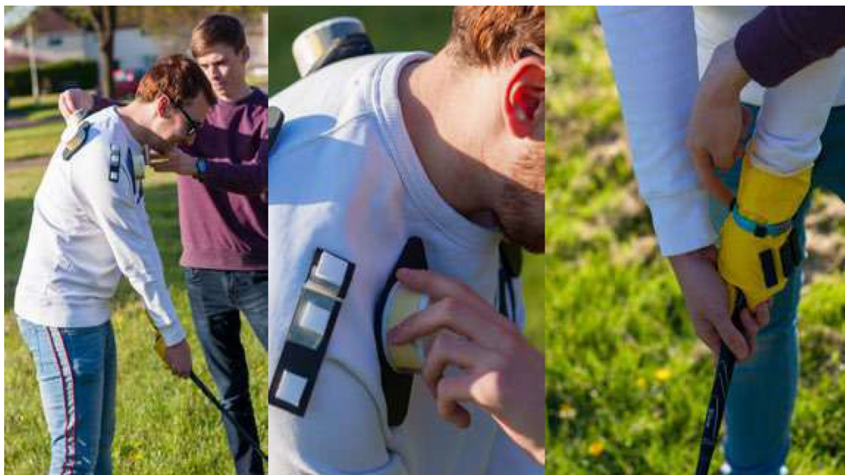
Figure 5. Later experience prototyping of iterated touch technology concept in context with a user.

This emergent UXD practice for designing with touch is in line with established UXD pedagogy, particularly how contextual scenarios are used to explore behaviour and the narrative of experiences before the details of user interfaces and (typically screen based) interactions are resolved. How students go on to articulate the sensory interactions once the overall narrative of the experience has emerged has yet to be resolved. Nonetheless, it is significant that studio-based and staff-supported experience prototyping provided the ID students with the knowledge and confidence to take these prototyping techniques out into the wild to further resolve their designs with target users later in the assignment (for example, Fig 5.).