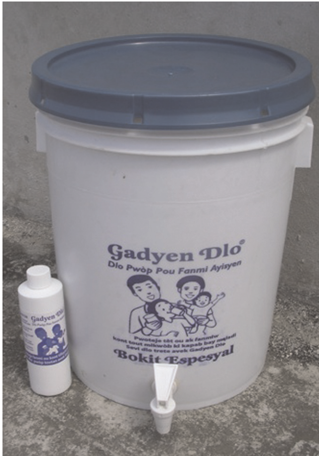
FIGURE 2. Jolivert Safe Water for Families safe storage container and sodium hypochlorite bottle (Source: Michael Ritter, Deep Springs International, Léogâne, Haiti).

non-enrolled control households? Second, do households enrolled in the program have significantly reduced point prevalence of diarrhea than non-enrolled control households, while adjusting for household characteristics that may confound the relationship between program enrollment and diarrheal disease?