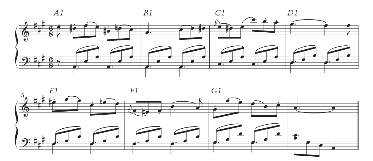
Example 1: The first eight-measure period of the first piece, assembled from the cards titled A1 to G1 (seen in plate 1).