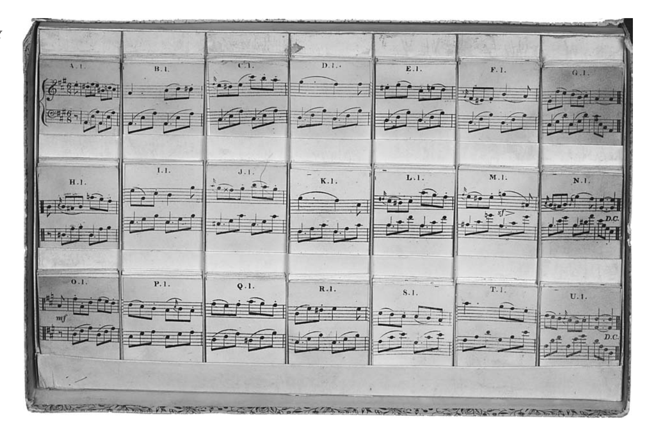
Plate 1: The tray of the Quadrille Melodist holding the cards labeled A1–U1.

several stacks of cards between performances or even between single repetitions of the "same" piece. Thus, music with differing degrees of unpredictability between individual playing sessions can be produced. For the player, it is possible to play the quadrille dance in the same combination, with only slight changes, or with a fully new arrangement of cards.