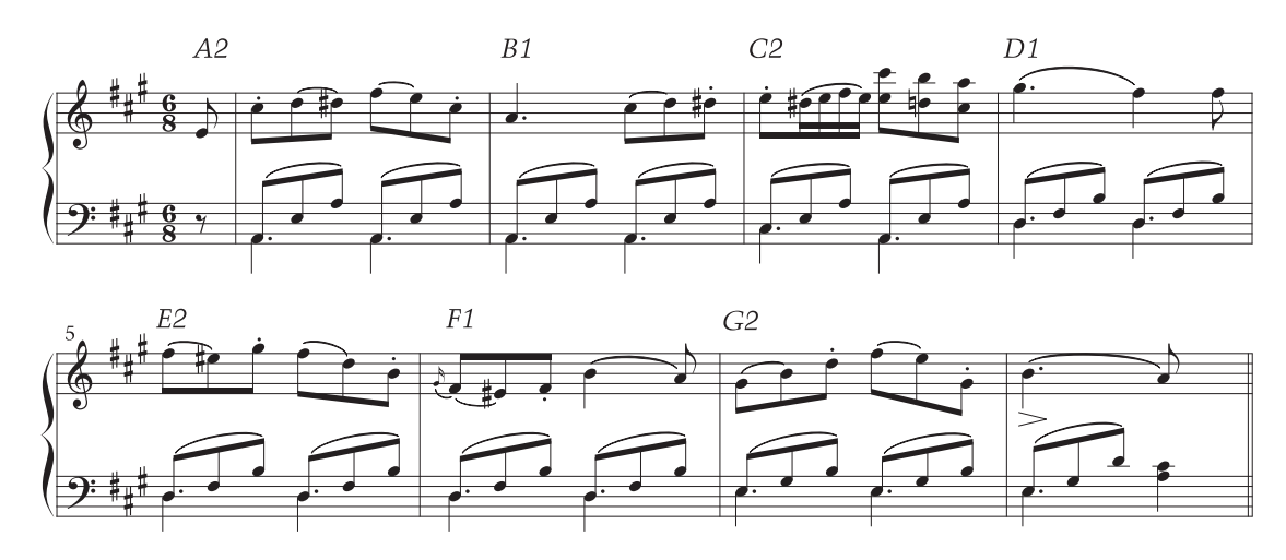
Example 2: Here, all odd-numbered cards from example 1 were replaced by the next card in the stack, leading to the following arrangement: A2, B1, C2, D1, E2, F1, G2.

second card, etc. With only two stacks there would have been eleven to the power of two combinations. With twenty-one stacks, there are eleven to the power of twenty-one combinations for each piece. This means that the number used by Clinton is, ironically, many orders of magnitude smaller than the correct result which is 7,400,249,944,258,160,101,211 or just over 7.4 sextillion combinations. This circumstance is even more stunning because in the nineteenth century it would have been trivial for a specialist to calculate the correct number, and Clinton (or his publisher) would have