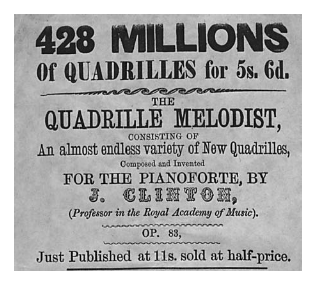
Plate 2: Advertisement for the Quadrille Melodist (detail). © British Library Board (Music Collections M.1.).

musical prints.<sup>39</sup> As plate 3 shows, George Cruikshank satirized the social setting of quadrilles, in which bumbling bodies were prone to crash inelegantly into one another. It is a setting, moreover, in which the Quadrille Melodist might have been used: an upper-middle-class public (indicated in the caricature by the paintings on walls and a chandelier) engaging in a public but informal performance of quadrilles.<sup>40</sup>